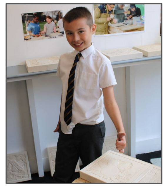
Art and Design Regis Manor Primary School